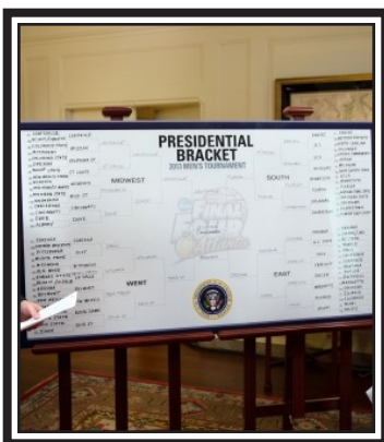
This is Barack Obama's 2013 March Madness bracket.

The Final Four in the 2019 bracket, to be played on April 6 are: Virginia, Auburn, Texas Tech, and Michigan State. The final championship game will be played on April 8, 2019. Who are you rooting for?