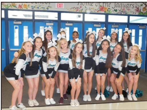
The Indian Ridge cheerleading team posing for the camera.