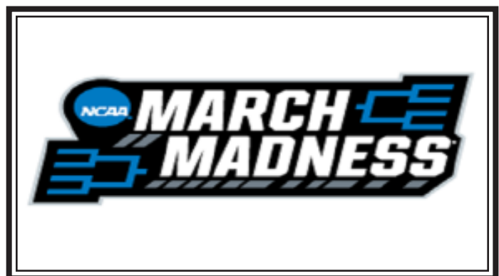
This is the March Madness logo.