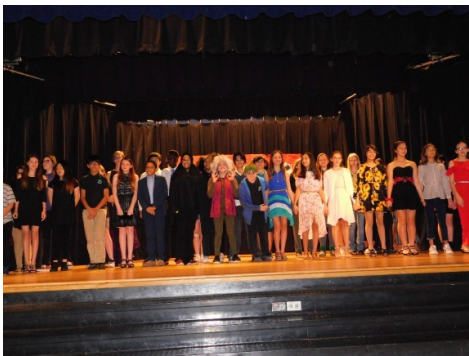
The people performing at the talent and fashion show take a picture at the end of the show.